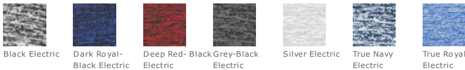
Black Electric Dark Royal-Black Electric Deep Red-Black Electric Grey-Black Electric Silver Electric True Navy Electric True Royal Electric